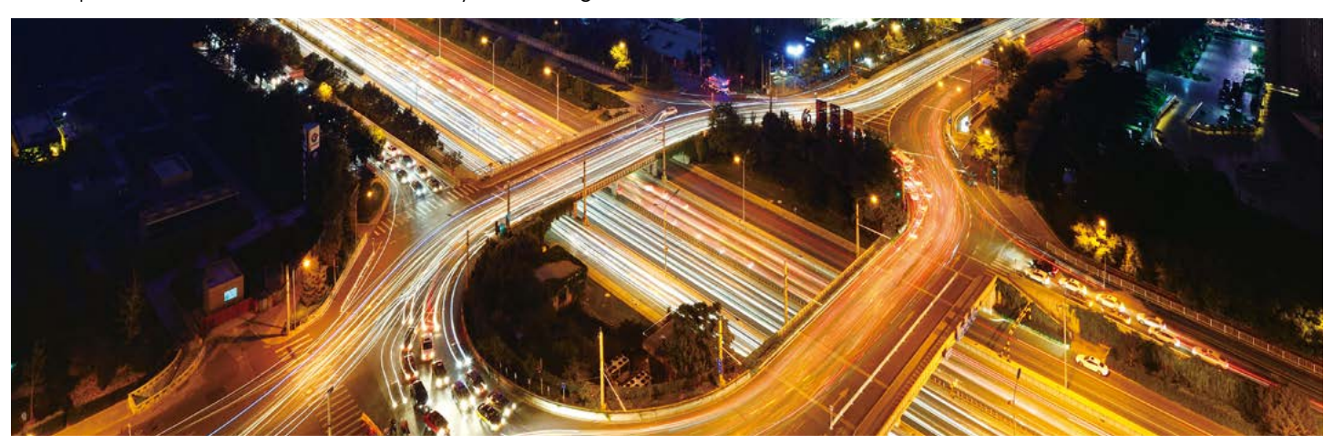
© 2018 KPMG LLP, a Delaware limited liability partnership and the U.S. member firm of the KPMG network of independent member firms affiliated with KPMG International Cooperative ("KPMG International"), a Swiss entity. All rights reserved. [Printed in the U.S.A.]. NDPPS 732610

the changing ecosystem and grow their business through customer-centric innovation and reach into new markets. Real-time readiness should be viewed as a strategic leap towards modernization, both from a business model and technology perspective. The right choices now raise the odds of long-term success in what is rapidly becoming the world's fastest growing payments mechanism. This paper, drawing on the insights of KPMG, ACI Worldwide and Vocalink, aims to show how to best seize the growing opportunities and stay in the competitive game, today and tomorrow.